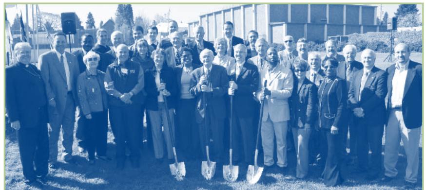
⌘ The April 11th "Groundbreakers" gather for a photo

Our foundation board of directors and development staff are busy raising the additional money necessary to complete