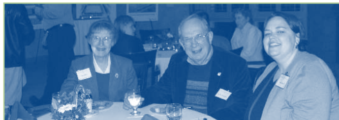
⌘ Alumni and friends enjoying one of many events held during Reunion Weekend.