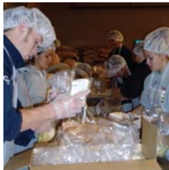
Volunteering at the Oregon Food Bank