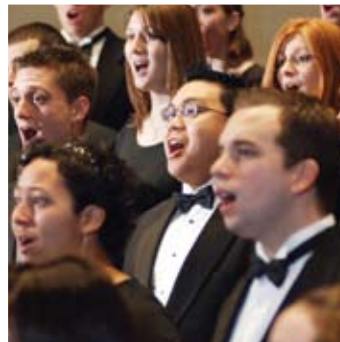
Annual Christmas Chorale